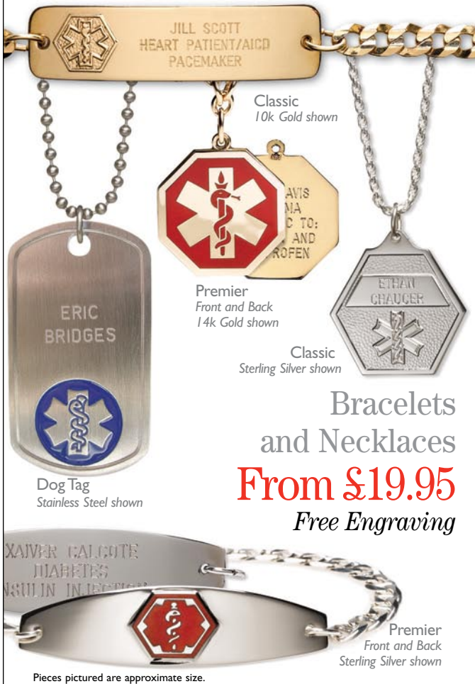
Classic 10k Gold shown